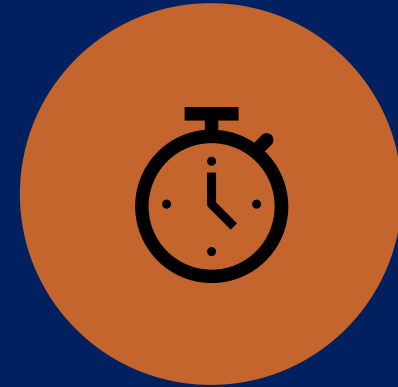
INFLATION REDUCTION ACT