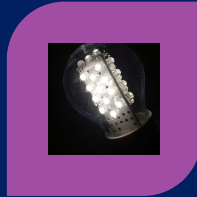
INFRASTRUCTURE INVESTMENT AND JOBS ACT