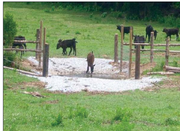
Figure 2. This stream crossing protects the stream bed while offering cattle access for drinking.

Through local community organizations (non-profit organizations, churches, etc.), the Clemson University Cooperative Extension shared information with homeowners about septic system maintenance needs and cost-share opportunities for septic system repairs. In addition, Extension reviewed existing aerial photographs and maps of septic system pump-out occurrences, and worked with septic pumping contractors to identify potential failing septic systems and high-risk communities. Extension agents worked with the Enoree River Educational Board to implement education and outreach programs, including the 4-H2O Pontoon Classroom/River Adventure, storm drain stenciling and Adopt-A-River.